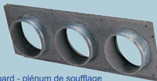
cap board - plénum de soufflage